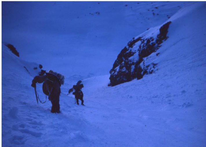
At Dawn The Snow Is Still Frozen And Firm