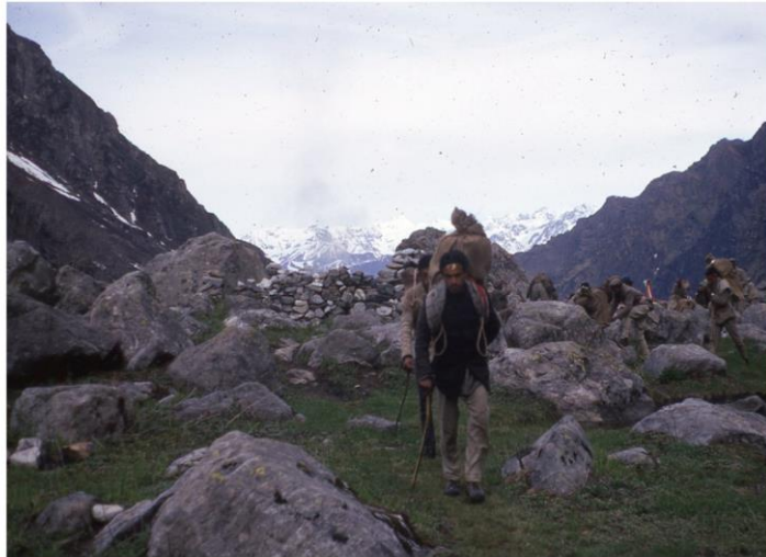
The Three Day Walk-In To Base Camp at 13,700 feet