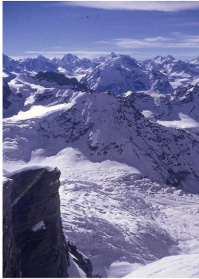
Lower Peaks Stretch To The Horizon