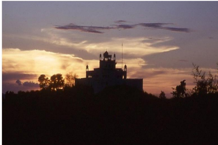
Indian Maharajah's Palace