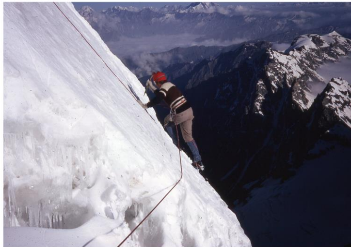
Above A Sheer Drop Of 9,000 Feet To The Valley