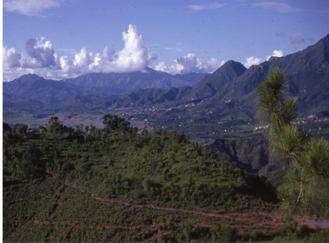
The Foothills Of The Himalayas