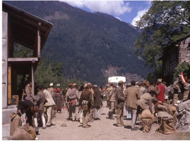
Porters Selecting Their Loads - Jagatsukh