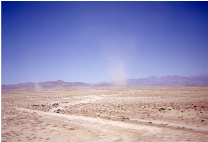
The Great Salt Desert - Eastern Iran