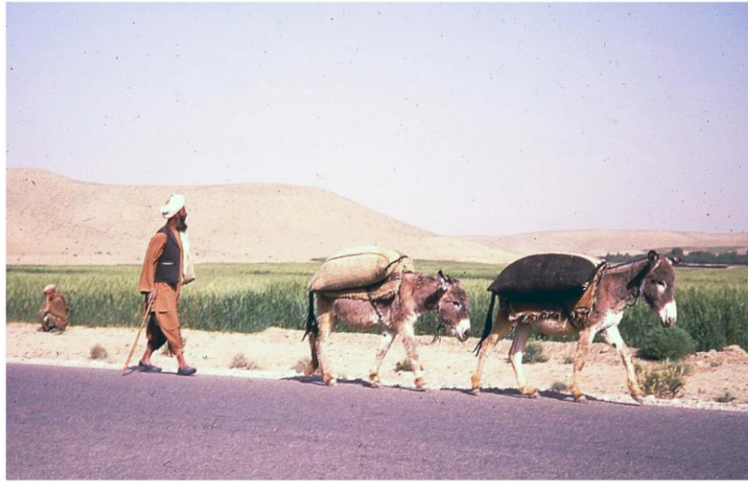
Donkeys - En Route To Market