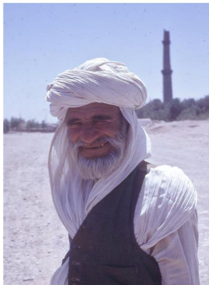
Afghan Man – Herat 1971