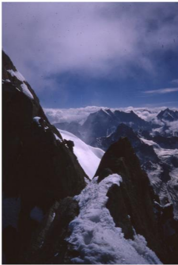
Dusk - West Ridge